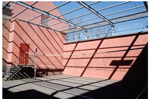
Volleyball court in Larvik prison.